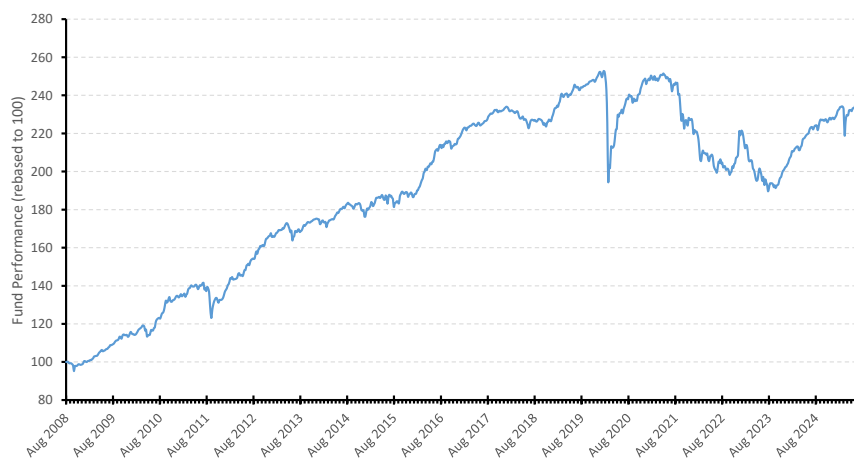
A USD (Acc)