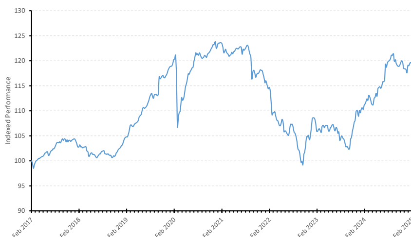
A USD (Acc)