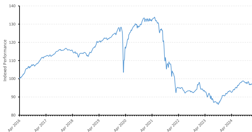
A USD (Dis)